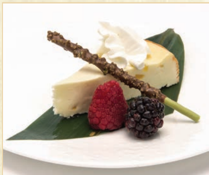
Mango Cheesecake 4.00

A slice of creamy cheesecake, smooth and sweet yet bitter as a cup of green tea.