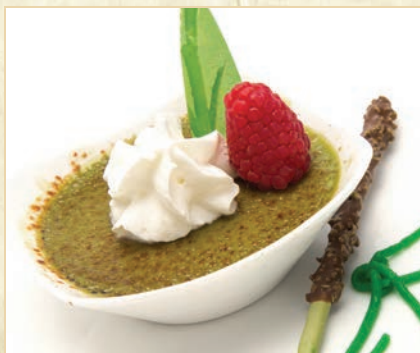
Green Tea Crême Brûlée 4.50

An individual portion of exotic crême brûlée made with green tea, vanilla bean, and caramelized sugar.