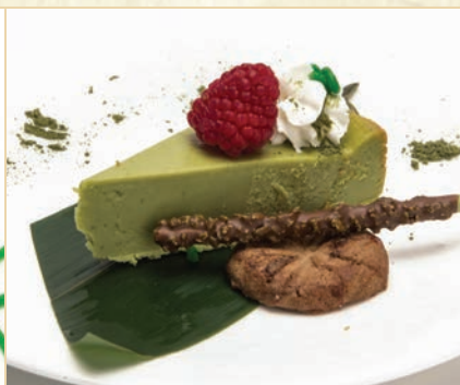
Green Tea Cheesecake 4.00

An individual portion of exotic crême brûlée made with green tea, vanilla bean, and caramelized sugar.