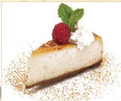
Tofu Cheesecake 6.00

A slice of thick, fluffy cheesecake with chunks of mango and a subtle, fruity flavour.